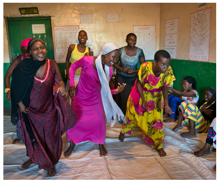
Girls at an ELA club in Tanzania sing and dance together.

In 2018, BRAC convened senior ELA staff from several countries to assess what factors might have contributed to the programme's poor participation rates.<sup>29</sup> ELA staff members cited ELA's curriculum, which was seen as dated and rote; the time commitment expectations of participants, which made it difficult for participants to attend each session; the wide age-range of participants in the same club; the lack of a graduation model, which kept some participants in the programme for years; and the need for more robust monitoring.<sup>30</sup>