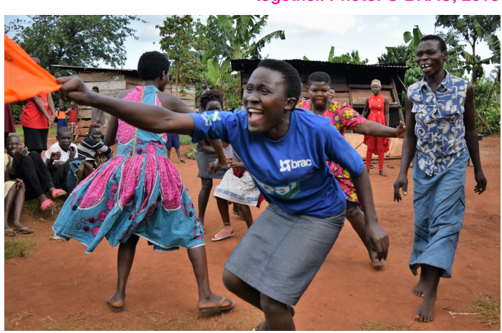
Girls in an ELA club play games outside together.

Once a community is selected for ELA, formal community leadership committees are formed. Working in partnership with ELA staff members, these committees are responsible for ensuring the smooth operation of the ELA clubs. In some areas, ELA staff also form parent committees, which offered an opportunity for parents to gain a deeper understanding of the ELA programme, and to receive more detailed updates on the progress of club participants.