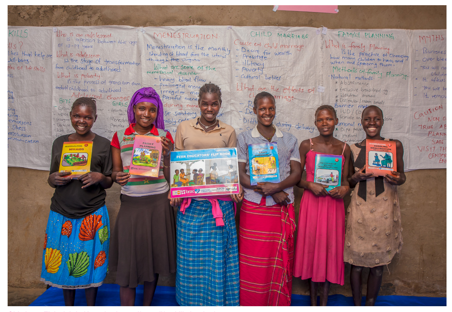
Girls in an ELA club in Uganda show off new life skills books from the redesigned ELA curriculum.

Over the past two decades, the development field has seen enormous gains in effective programming for adolescent girls and young women, including through investments in evidence-based approaches such as the Empowerment and Livelihood for Adolescents (ELA) programme initiated by BRAC. BRAC is a leading international nonprofit with a mission to empower people and communities in situations of poverty, illiteracy, disease and social injustice. Randomized evaluations in several contexts have demonstrated ELA's positive impact, which is achieved by delivering empowering and engaging content covering sexual and reproductive health, economic skills and valuable life skills in girls' clubs or safe spaces. The United Nations Population Fund (UNFPA) recognizes BRAC as a leader in the field and a valued partner in its mission. In the spirit of learning, UNFPA, in keeping with its commitment to gender equality and sexual and reproductive health and rights, with a particular focus on adolescent girls, supported this synthesis of lessons learned over the 15-year history of the ELA programme, for the benefit of the wider development community. Note that the views expressed herein can in no way be taken to reflect the official opinion of UNFPA.