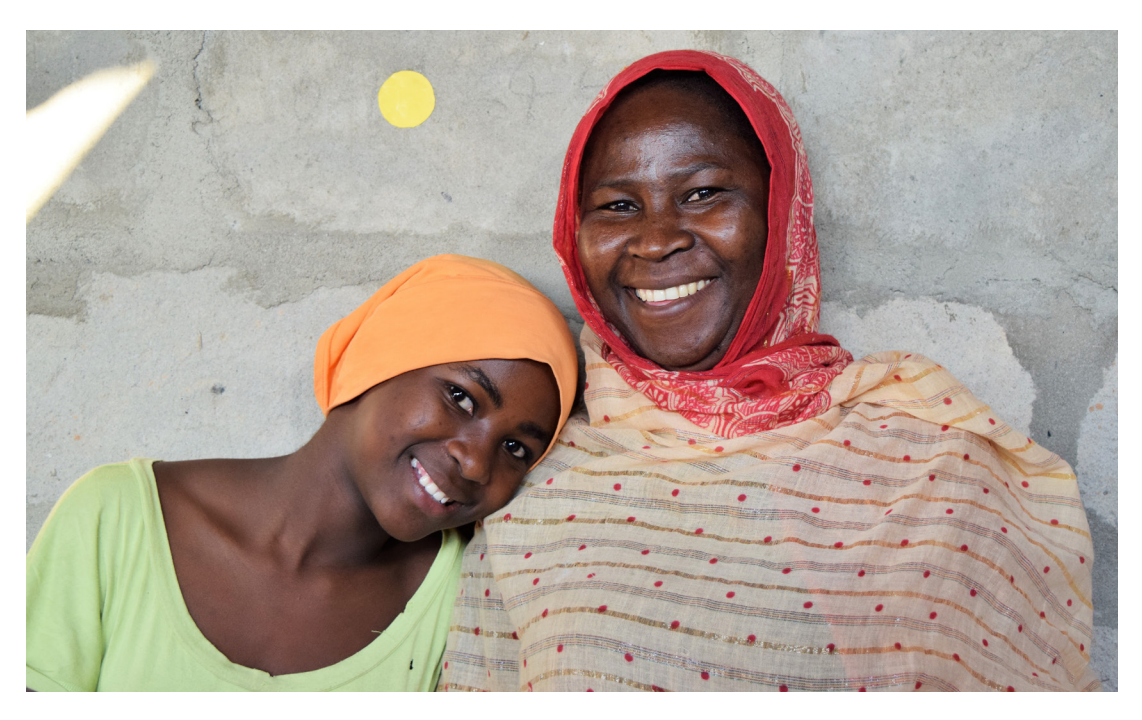
An ELA participant in Sierra Leone with her mother. Engagement with parents is key to the program's success.

As BRAC and others adapt the programme to new contexts and delivery channels, new research will be essential in order to understand what level of programming and which programming components are necessary to achieve impact. This understanding would allow BRAC and others to maximize cost effectiveness and scale for ELA and ELA-like programmes, thus delivering a wealth of opportunities for a new generation of adolescent girls and young women.