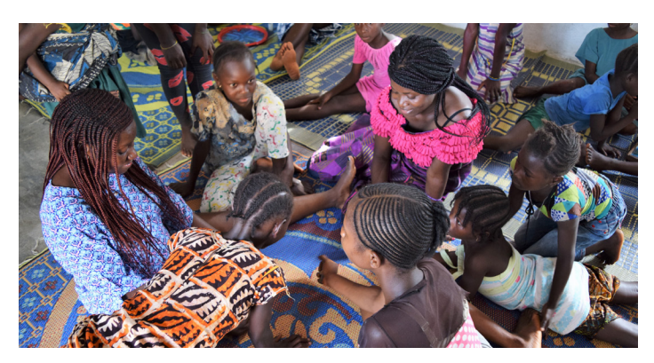
Safe spaces where girls can socialize are a crucial component of the ELA model.

There was a sense that the ELA curriculum had grown outdated over the years. Programme staff described the original ELA curriculum as lacking "in its discussion of sex, gender and reproductive health;"<sup>31</sup> "not always relevant"