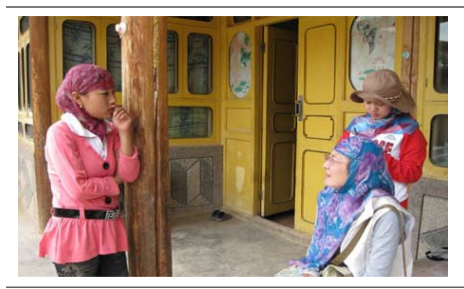
In-depth interview of a Hui young women, Hualong County

Young peoples of all six ethnicities reported obtaining knowledge about reproduction primarily from older generations. As products of their specific ethnic cultures and traditions, young people are consciously or sub-consciously influenced by traditional beliefs and practices, especially those who have lived in rural or pastoral regions. In recent years, as more and more young people have left their homes to study or work, their concepts and ideas concerning reproduction and maternal health have to some extent changed. Young people who have received a higher education or traveled outside their communities have a higher degree of acceptance of modern maternal health practices and higher levels of reproductive health knowledge.