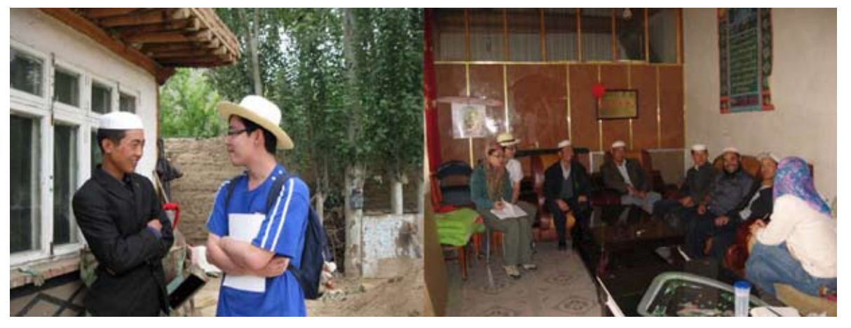
Interview with Hui young man and FGD with

The team here undertook 5 FGDs: with 3 local officials, 4 local MCH staff; 3 young men aged between 15 and 24 years, unmarried or married but without children; 5 women including pregnant women, mothers and grandmothers; and 4 fathers.