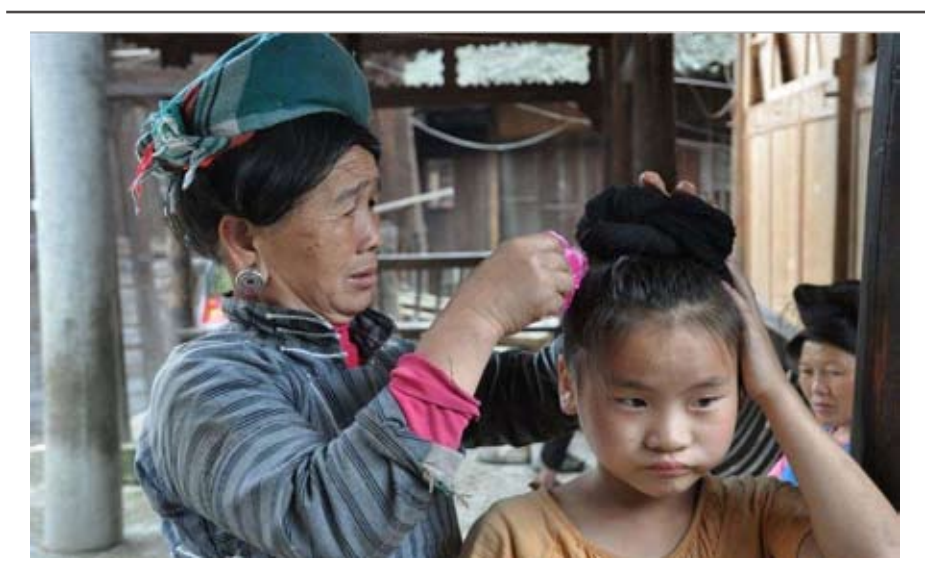
A Miao grandmother with her granddaughter, Leishan

There is similarity in the identity and role of caregivers among all six ethnic groups. In extended families, new mothers and elderly women are the primary caretakers. Older female family members help young mothers staying at home to take care of babies. As more and more young couples leave home for work, herding or digging herbs, the elderly women at home will look after children. Some young couples travel far and return to home only during the Spring Festival once a year or even after several years.