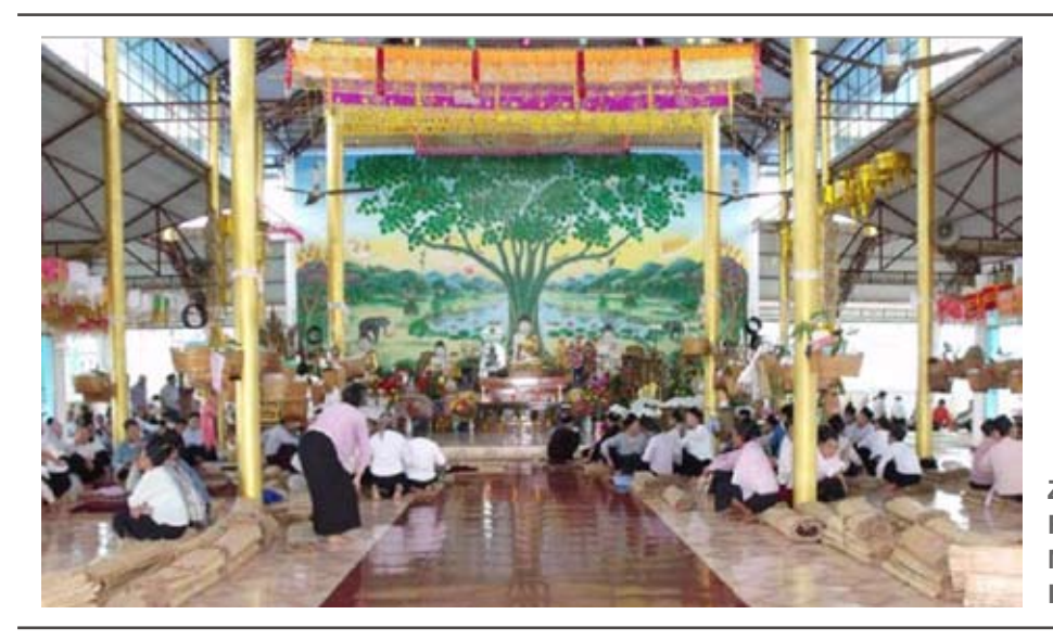
Zhuangfang Dai Religious Center, Mangbie Village, Luxi County

There are five-hundred definitions of "culture" in cultural anthropology. In this survey, we propose to define "culture" as the Chinese philosopher Liang Shuming termed "a way of life." We hold that "culture" includes the following basic aspects: