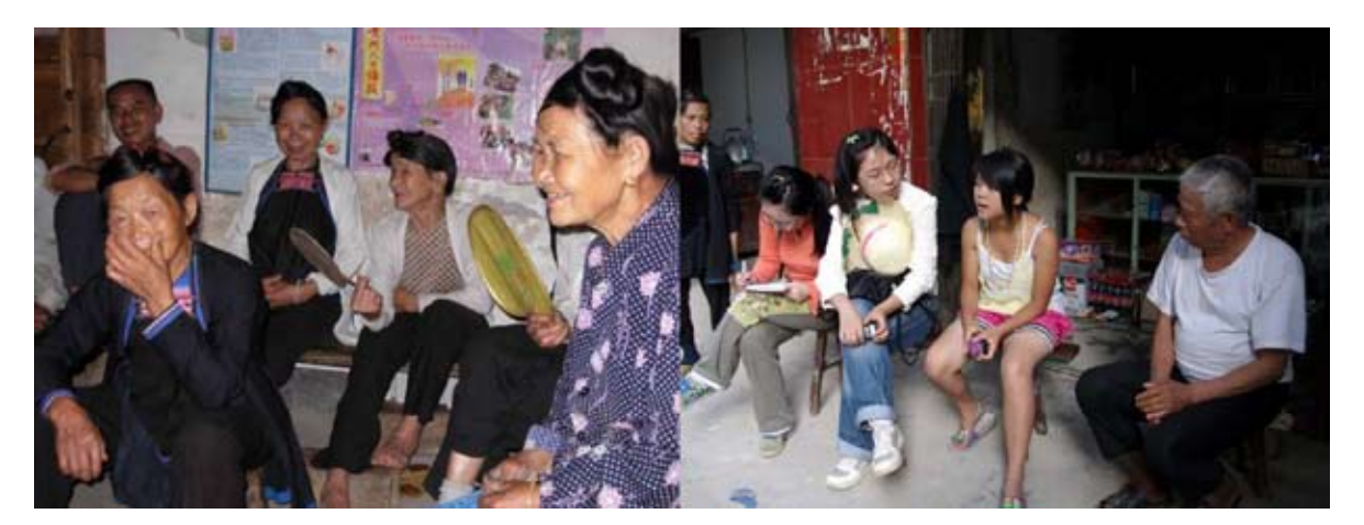
FGD with Dong mothers and grandmothers and Interview with a young unmarried woman

In Congjiang, Guizhou, the survey team interviewed 39 persons. The interviewees comprised: 8 local government officials; 2 community and religious leaders; one traditional doctor; 3 young men (between 15 and 24 years old and without children); 3 young women (between 15 and 24 years old and without