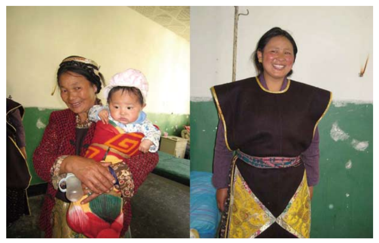
Grand mother, mother and child in Gyamda Hospital, Tibet