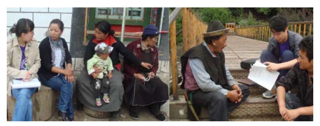
In-depth interview with Tibetan mothers and fathers

The survey team in Tibet's Gyamda County interviewed 52 persons. The interviewees comprised: 12 local government officials; 2 community leaders; 3 religious professionals, 6 young men (between 15 and 24 years old and without children); 6 young women (between