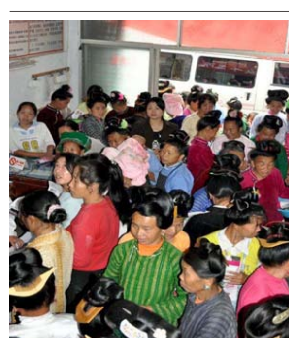
Miao women waiting for physical examination in Datang Township Hospital, Leishan

The following recommendations are aimed at increasing access to and utilization of MCH services.