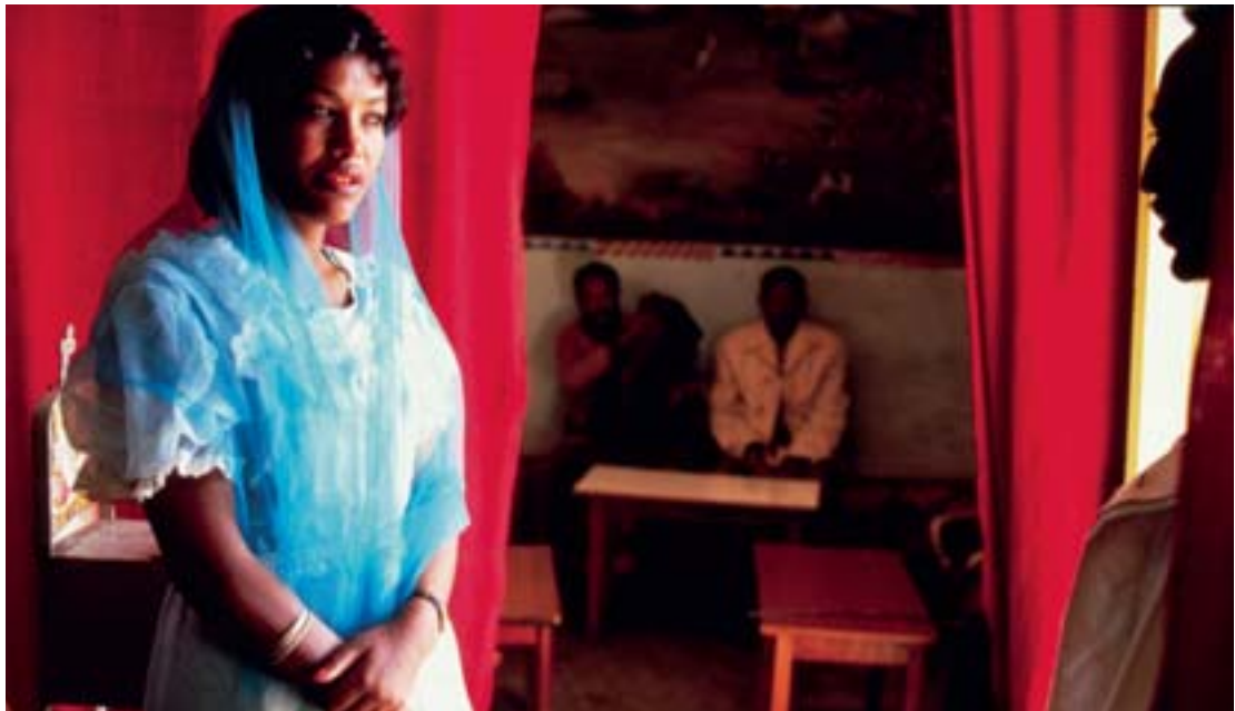
Prostitute in Piazza area of Addis Ababa, Ethiopia.

spotlight as a major health and human rights concern.