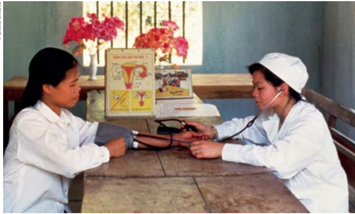
Reproductive health information at a local clinic in Na Phoon, Viet Nam.

In June 2004, UNFPA and UNAIDS, in collaboration with Family Care International, convened a high-level global consultation at the Rockefeller Foundation in New York. Participants, including parliamentarians, ambassadors, leaders of United Nations and other multilateral agencies, donor organization officials, community and non-governmental organization leaders, young people, and people living with HIV issued The New York