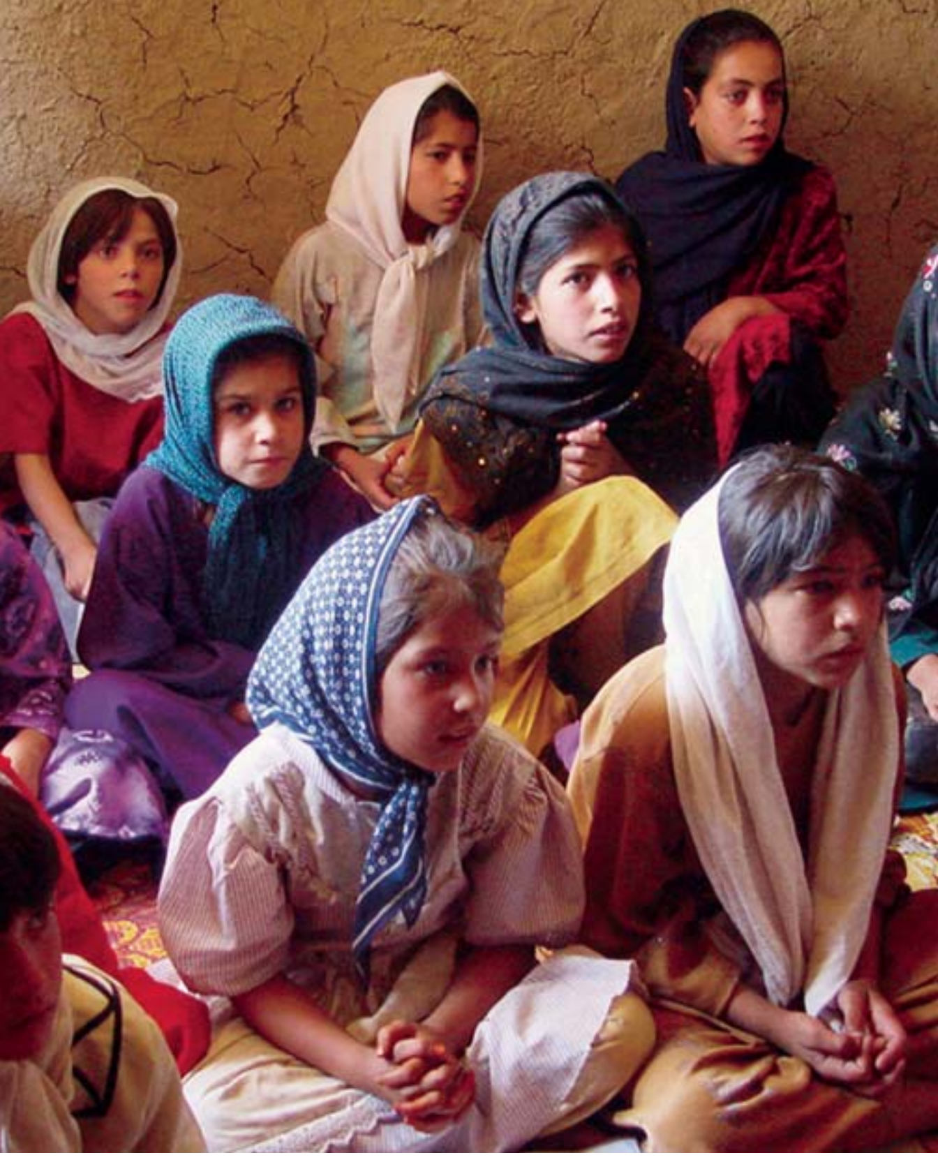
Promoting girls' right to education in Kabul, Afghanistan, is one way of working towards achieving the objectives of the Beijing Platform for Action.