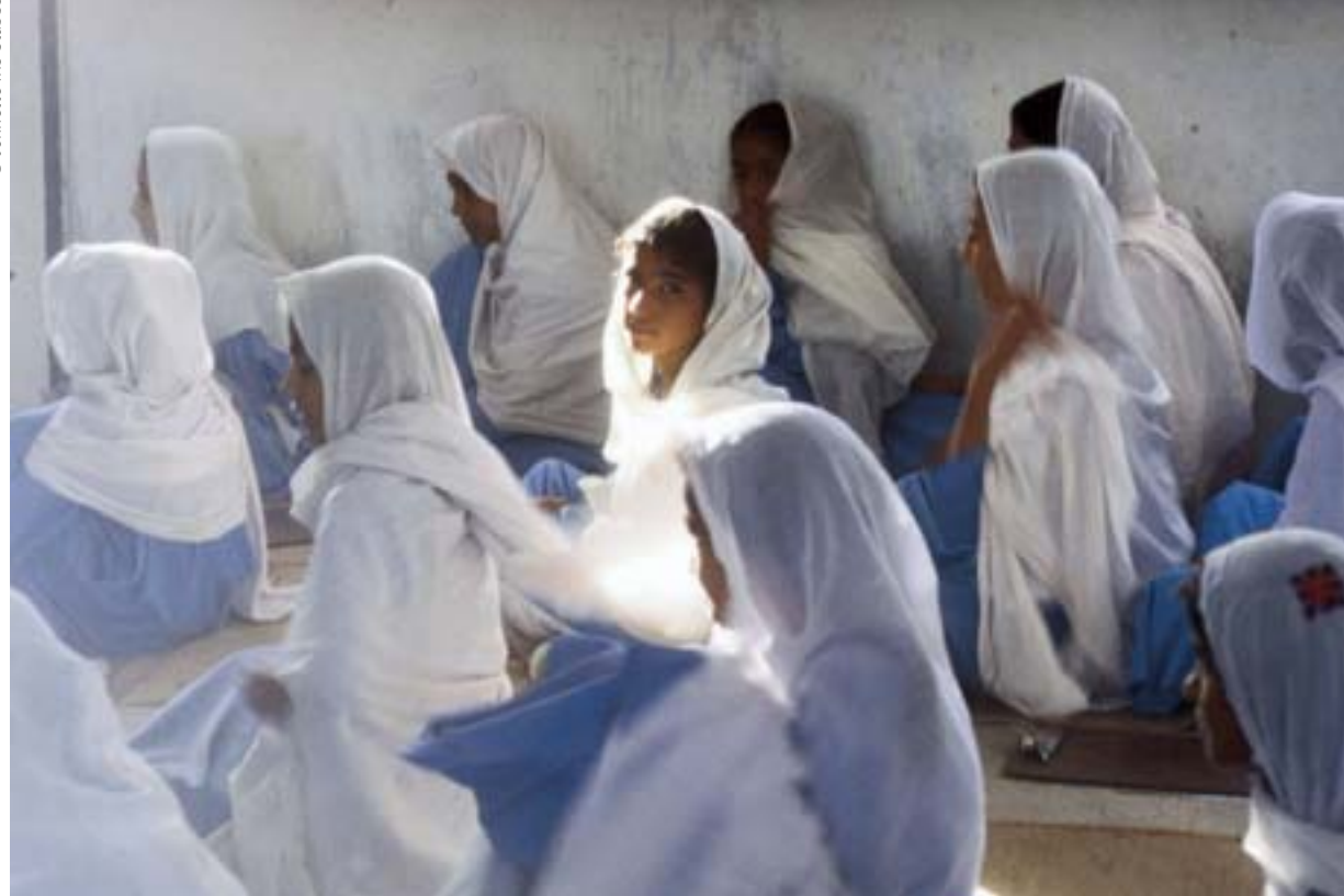
Girls education is critical to expanding their choices in life. Here, girls attend school in Pakistan.

Unfortunately, much more needs to be done before all women can enjoy the empowerment that education provides. The Beijing +5 review pointed out that efforts to