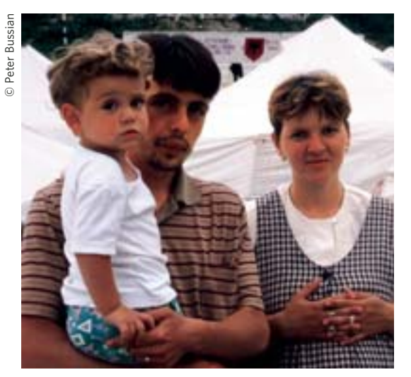
Pregnant woman and family in a Tunisian camp in Tirana, Albania.

tection from sexual violence and abuse in their homes and communities, in refugee and internally displaced persons' camps as well as in disarmament and demobilization areas. UNFPA has been at the forefront of international efforts to protect women against violence in conflict situations. In an address to the UN Security Council in October 2004, UNFPA warned: "If women and girls, and communities as a whole, are threatened by gender-based violence, then there is no real chance for peace and security. If the needs of victims of sexual violence are not recognized and addressed, then the opportunity for