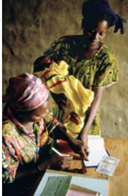
Empowering women through microcredit in Burkina Faso.

In the UNFPA Global Survey undertaken in 2003, 66 of 144 responding countries reported having taken measures to