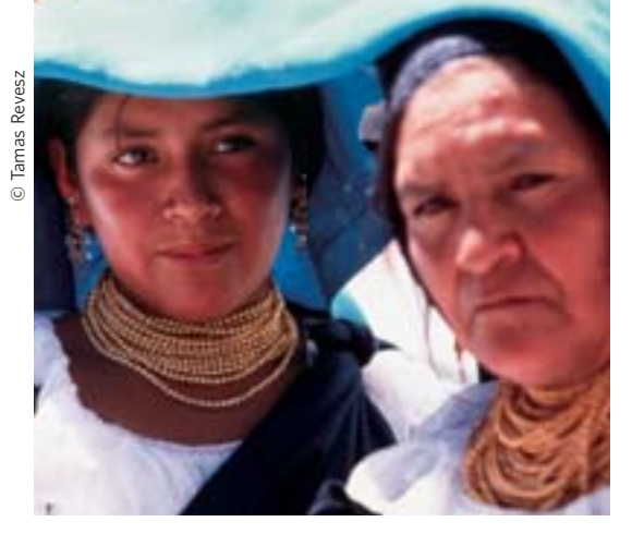
Despite some improvement of the equality between women and men, participation of women in decisionmaking has not significantly changed since Beijing.

UNFPA works to enhance women's decisionmaking capacity at all levels in all spheres of life, especially in the area of sexuality and reproduction. One priority for improving political opportunity is increasing women's share of seats in local and national government bodies.