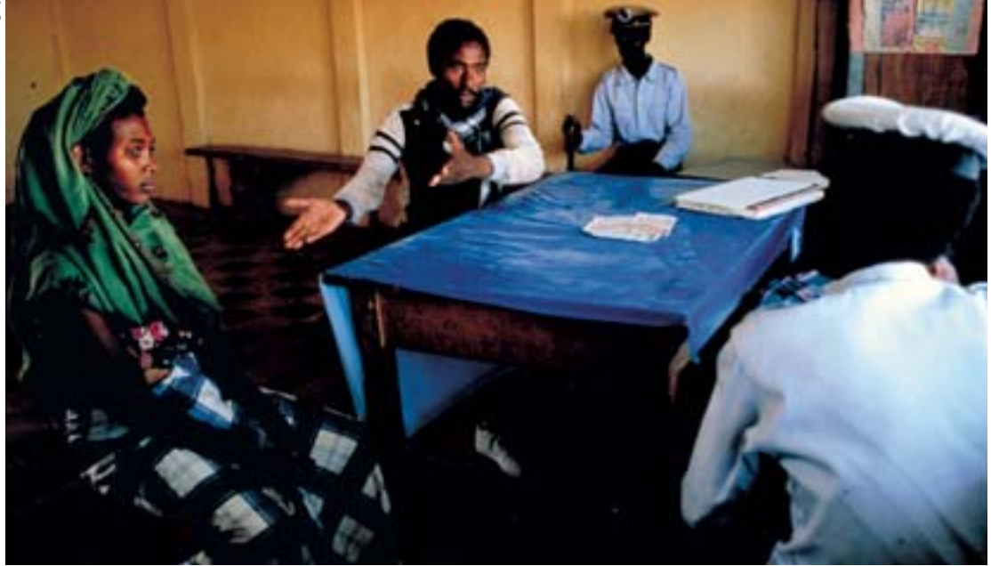
A woman takes her husband to the Islamic court for domestic violence in the Afar area of Ethiopia.

abuse and assist victims. The trainings stressed the need for confidentiality and monitoring. Based on this experience UNFPA has produced a manual, A Practical Approach to Gender-based Violence , which has been translated into seven languages.