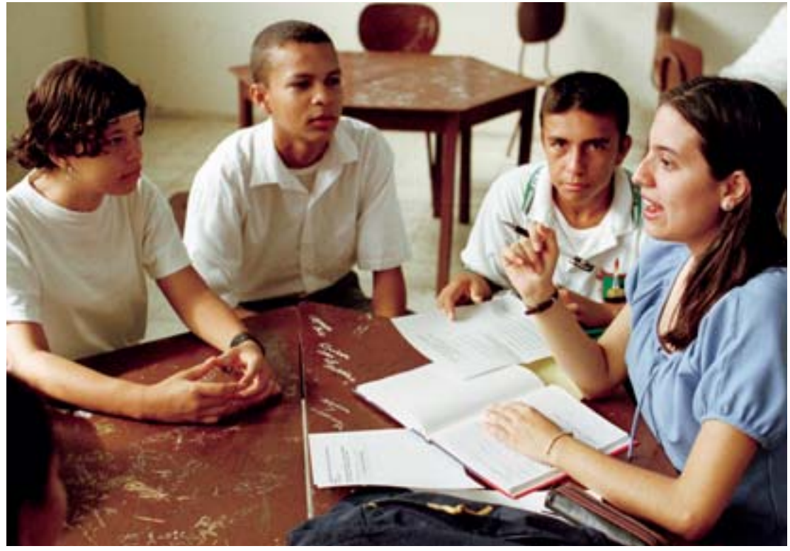
Workshop about sexuality, love and reproduction for teenagers at a local college. The workshops are organized by Corporacion de Desarrollo de Magdalena Medio (Magdalena Development Organization), funded by UNFPA.

UNFPA in Nicaragua has developed a model of motivation and education in reproductive health and rights through municipal youth clubs. The youth club activities are implemented through AMUNIC, the local government association of Nicaragua. The clubs provide recreational space for adolescents and motivate participation in behaviour change communication activities. Young people are trained as reproductive health and rights promoters and work in their communities using adolescent-to-adolescent contacts and a wide range of media (newsletters, radio spots, theatre, etc).