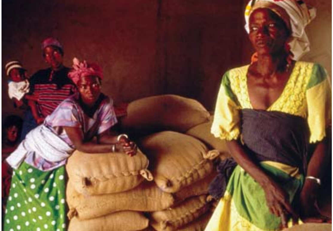
Women constitute 51 per cent of the agricultural work force in the world. These women work in a grain cooperative in Yatenga province, Burkina-Faso.

for sustainable development. UNFPA provides support for institutional capacity building for implementing, monitoring and evaluating policies and programmes to improve data collection, analysis, research and dissemination, and promotes population education and advocacy.