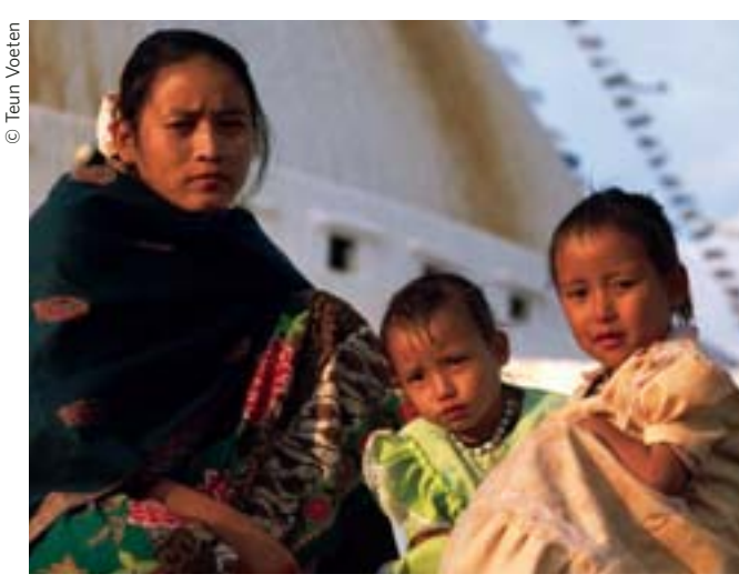
Woman with children sitting on edge Stupa, a Bhuddist temple just outside Nepal's capital.

of the Government. On the macro-level, this clarified the progress of the demographic transition in Nicaragua, including the issue of the "demographic bonus." On the microlevel, UNFPA analysed household survey data to show the greater upward economic mobility enjoyed by families with fewer dependent children; and investigated the relationship between the productive and