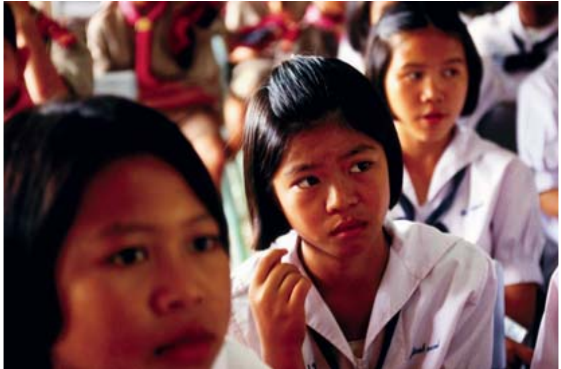
Adolescents are eager to learn about reproductive health issues from their peers, Chiang Rai, Thailand.

The African Youth Alliance, a programme developed by UNFPA, the Program for Appropriate Technology in Health (PATH) and Pathfinder International, has strengthened the ability of existing organizations to serve youth more effectively, created new methods and techniques, and changed the lives of thousands of African young people, by improving adolescent sexual and reproductive health in Botswana, Ghana, Tanzania and Uganda .