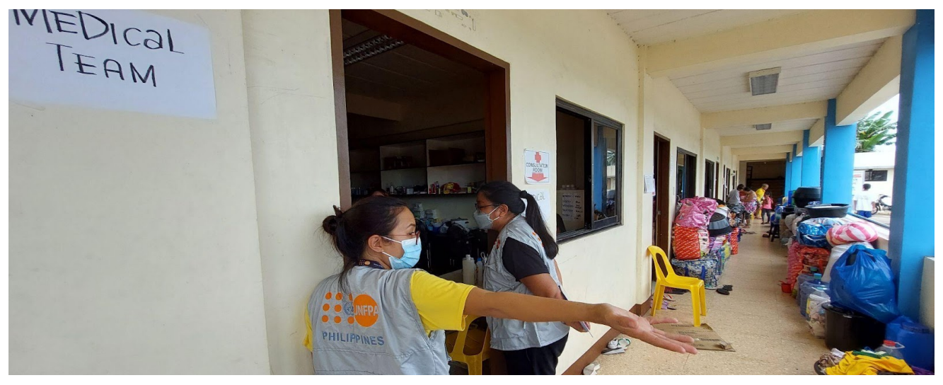
UNFPA field team in Southern Leyte supported a Mental Health and Psychosocial Support (MHPSS) intervention for displaced families affected by Tropical Storm Agaton on 27 April 2022.

The Commission on Election (COMELEC) issued a resolution on the prohibition of any public official or employee to release, disburse or expend public funds, effective 25 March 2022 until 8 May 2022. This prevented government agencies from directly disbursing cash, food, and material assistance to survivors of GBV, especially at crisis centers. The GBV Sub-Cluster, working with the Protection Cluster, continued its advocacy for the principles of Centrality of Protection, Do No Harm and Accountability to Affected Populations (AAP).