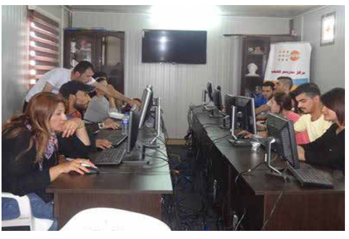
First computer session for youth at Serdam Youth Centre in Iraq.

The Serdam Youth Centre Theater Group presenting a play titled 'Where we Were and Where We Are' on the occasion of World Population Day.