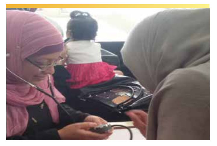
Syrian women in the women counseling unit, Hacettepe, Turkey

WOMEN AND GIRLS SAFE SPACES: Support for two safe spaces continued in 6th October and Damietta. These spaces provide several services including psychosocial support, training, recreational activities, awareness campaigns, and sport activities. UNFPA supported the establishment of a safe space in Maadi, Cairo, in collaboration with Care International and signed a grant for the establishment of another safe space in Obour with the Egyptian Organization for Human Rights. This safe space is expected to become functional by next month.