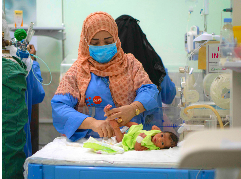
A nurse attends to a premature baby at UNFPA-support Al Shaab Hospital, Aden, Yemen