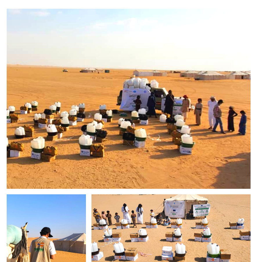
Distribution of rapid response kits in frontline areas of AI Jawf

94,171 RRM kits distributed through the Sa'ada humanitarian hub from June 2018 to March 2022.