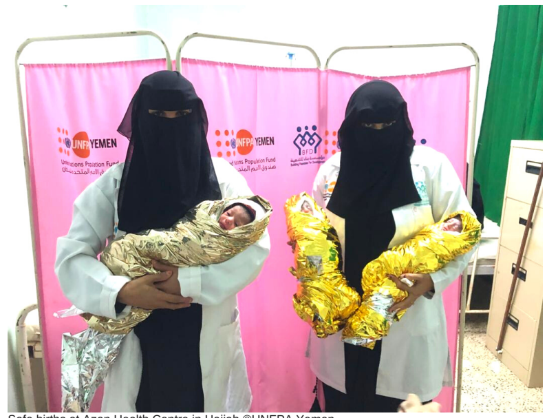
Safe births at Azan Health Centre in Haijah