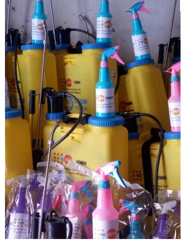
Top to bottom: Distribtution of RRM kits in Taizz, dsinfecting maternity wards and UNFPA-procured supplies for health facilities in south Yemen