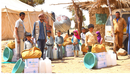
Distribution of rapid response kits to displaced families in Al Jawf and Hadramout