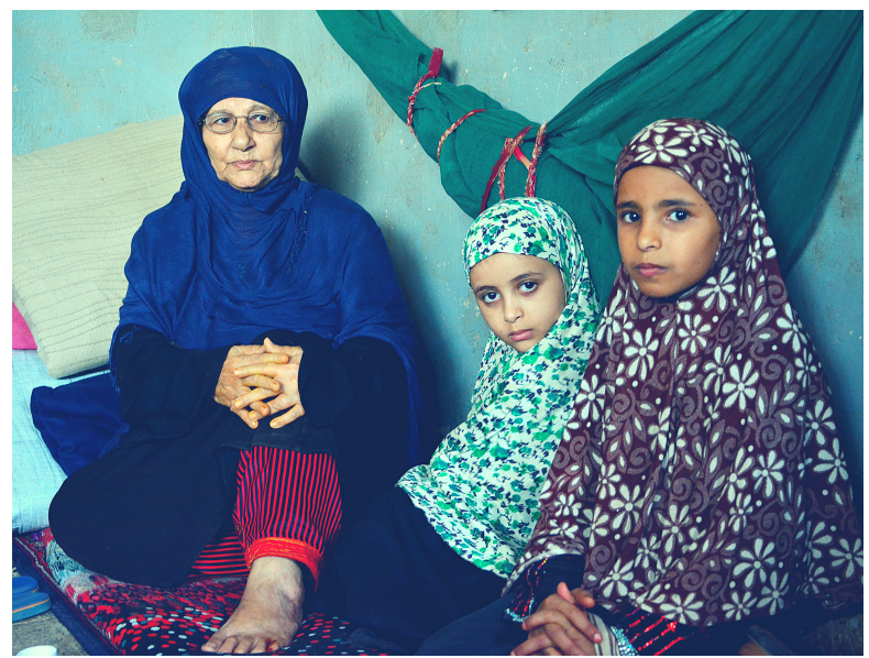
A displaced family inside their temporary shelter in Sana'a