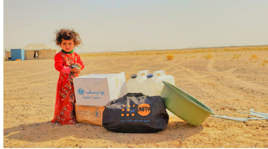
Distribution of rapid response kits to displaced families in Al Jawf Governorate.