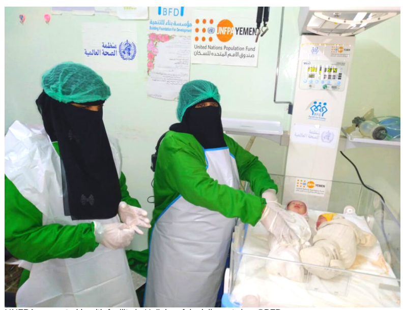
UNFPA-supported health facility in Hajjah safely delivers twins.