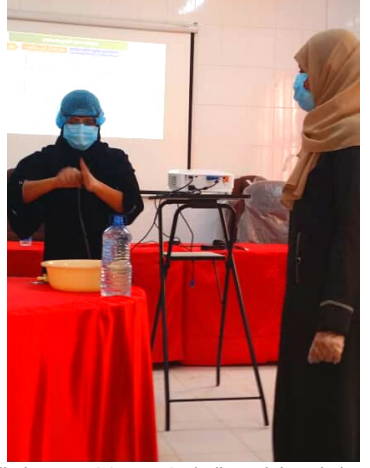
Top to bottom: Distribution of oxygen cylinders to COVID-19 dedicated hospitals, awareness raising in displaced camps and training on mitigation measure among health workers