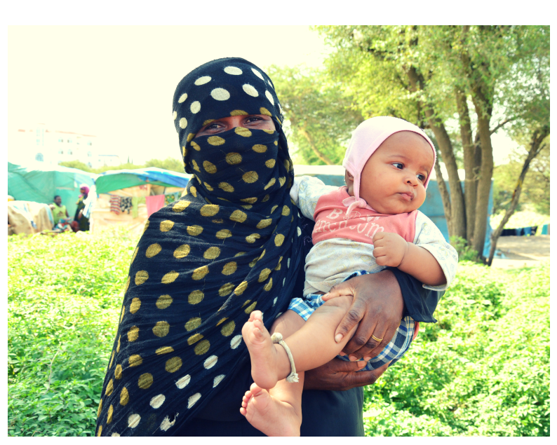
Internally displaced mother and child, Ibb