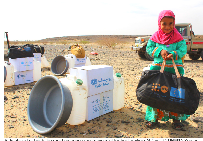
A displaced girl with the rapid response mechanism kit for her family in Al Jawf