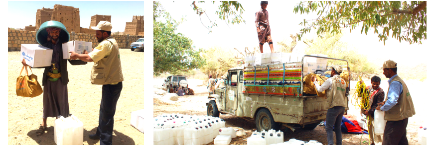
Distribution of RRM kits among displaced families in Al Jawf Governorate