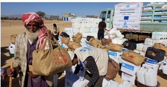
Distribution of RRM kits among displaced families in Kitaf and Al Ghamar districts in Sa'ada Governorate.