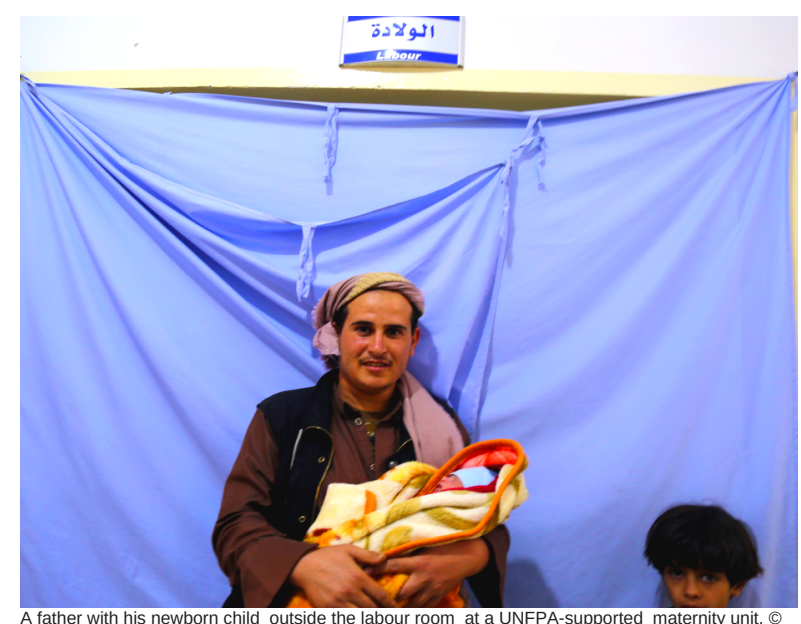
A father with his newborn child outside the labour room at a UNFPA-supported maternity unit.