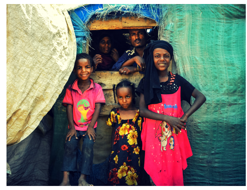
A displaced family from Taizz