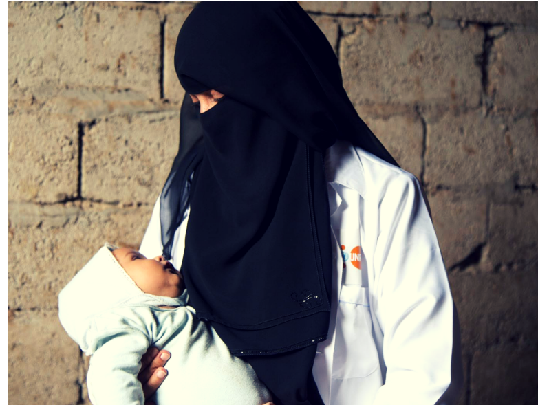
A UNFPA supported midwife during a visit to an IDP camp in Taizz.